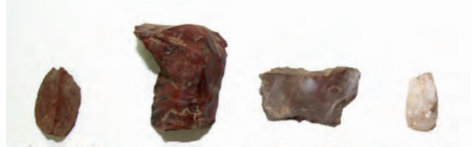
Aboriginal artefacts found during archeological investigations.

The original Aboriginal inhabitants and traditional owners of the land on which Vista Park now sits are the Dharawal people. As there was no permanent water supply they most likely used the area for short term camping and foraging.