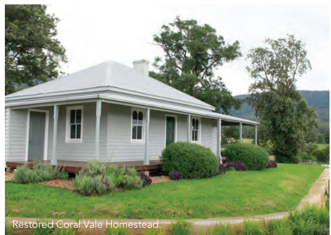
Restored Coral Vale Homestead.