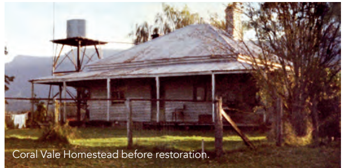
Coral Vale Homestead before restoration.