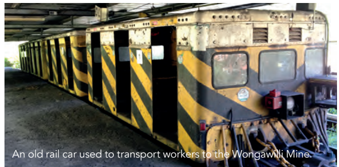
An old rail car used to transport workers to the Wongawilli Mine.

Throughout its history Wongawilli has had two main industries being the dairy industry and coal mining. Coal was first discovered in the Wongawilli region around the 1880s, however, the first coal mining activity didn't take place until 1906.